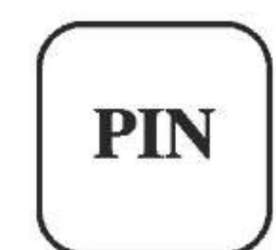
Personal Identity Number